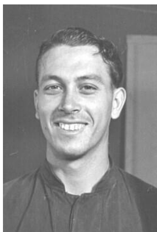
Virtual War Memorial Australia